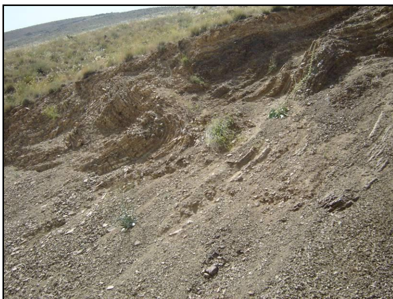
Fig.3 A part of Pourkan-Vardij fault zone

There are several faults in the tunnel route. The main fault zone and crushed zone is Pourkan-Vardij fault zone that cuts the tunnel route in 6417 to 6442 meter from end of the tunnel (Fig.3). It should be noted that CZ and FZ show crushed and fractured zones respectively due to fault activity.