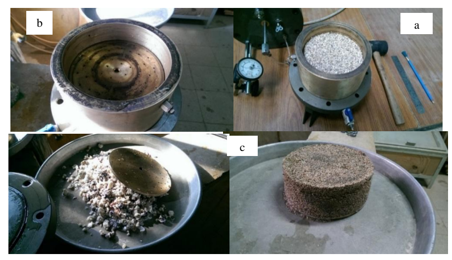
Figure 1. Material and apparatus a) Rowe Cell, b) Sand inside Rowe cell, c and d) Specimen after loading

(Figure 1). Poorly graded sand samples with big, medium and small size particles (in margins of sand definition) were tested.