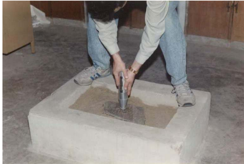
Fig. 1: Measurement of uniaxial compressive strength (JCS) by L-type Schmidt rebound hammer under saturated condition.

up to 30 cm. The samples were placed firmly in the fine sand to avoid sample movement during experiment (Fig.1).